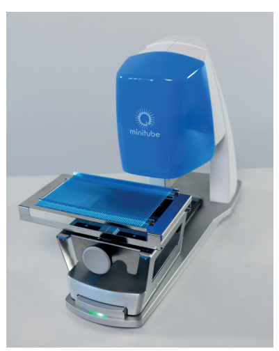
Countless application possibilities - which one is yours?